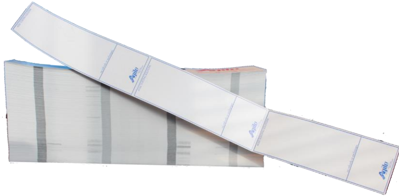
AgileTix branded Ticket Stock (bundle)

One bundle of AgileTix Ticket Stock has 1,000 tickets.