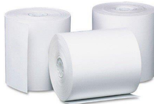
Non-Perforated Thermal Paper